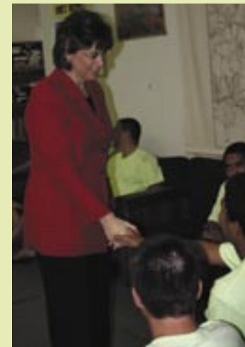
Governor Lingle visited MYFS residents last year and made a lasting impression.

Office of Hawaiian Affairs (OHA) gave MYFS a grant in the amount of $24,688 to provide experiential educational activities based on Hawaiian cultural values, traditions, and practices to Hawaiian youth being treated in its Ho'o Maka Hou residential substance use disorder treatment program. The program will provide services to at least 50 Hawaiian youth. Activities will include, teaching and involving youth in the cultivation of taro for subsistence use and commercial markets; (2) provide kupuna mentors for youth participants; (3) sea voyaging experiences in cooperation with the Marimed Foundation; and (4) nature campouts that teach the values of Aloha Aina.